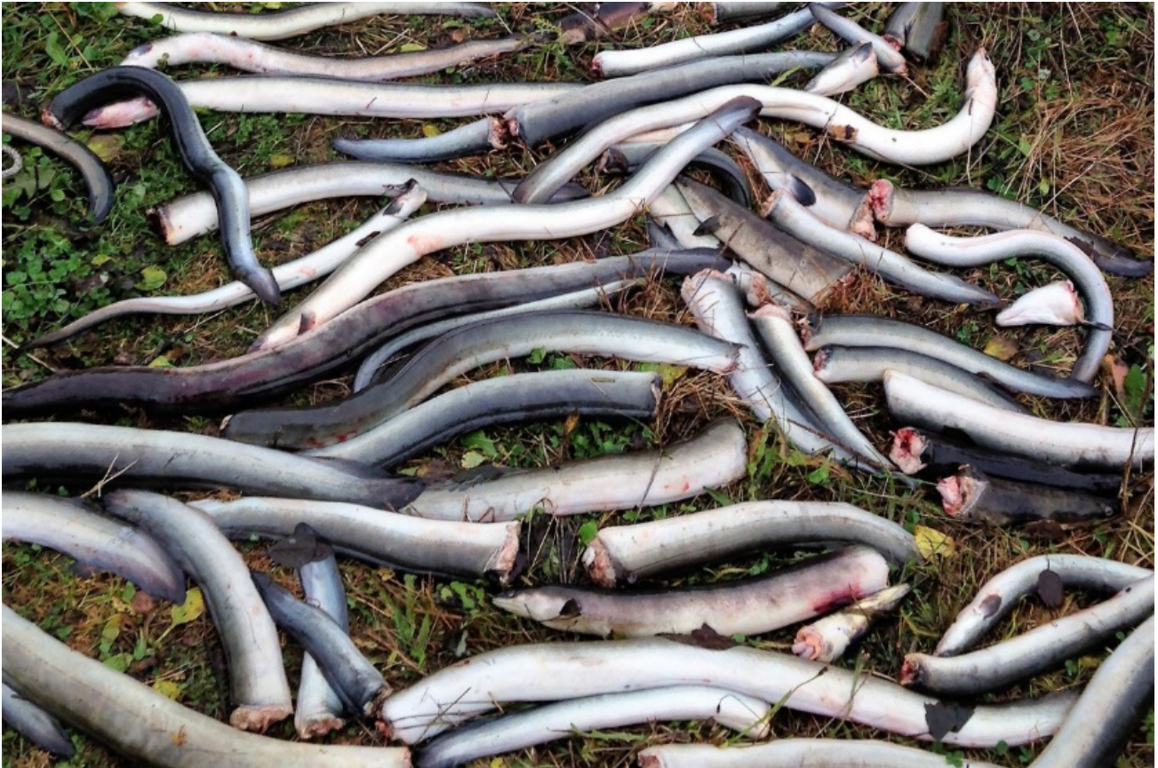
Eels killed by hydropower turbines during their natural downstream migration.