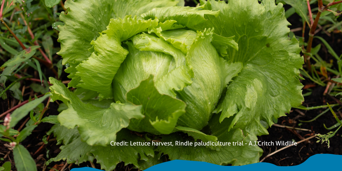
Lettuce harvest, Rindle paludiculture trial